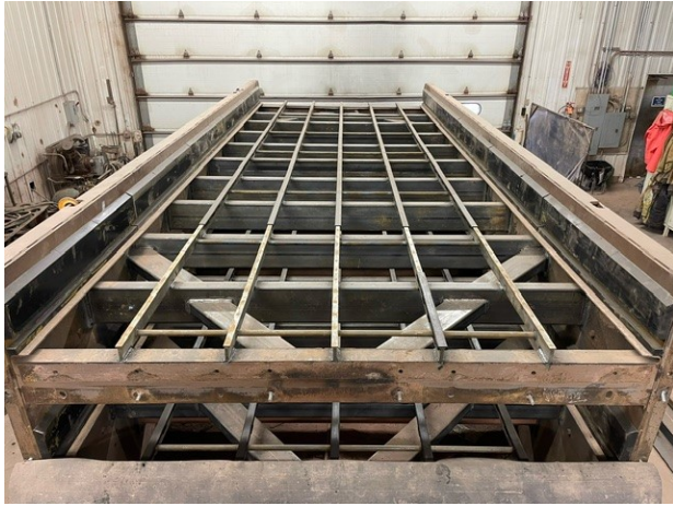
East Sioux Quarry 8'x20' Diester screen rebuild and ready for the production season.

Even with careful planning not every task goes exactly as planned. Last time I checked, crystal balls were still out of stock on Amazon. But if we plan for the foreseen, the unforeseen becomes a little less burdensome when they pop up.