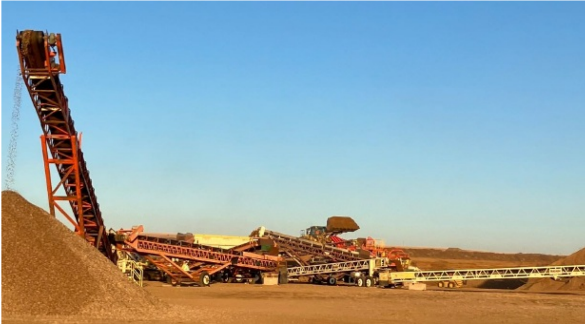
Reynolds Pit - Portable Plant